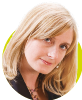
CRESSIDA COWELL The Wizards of Once