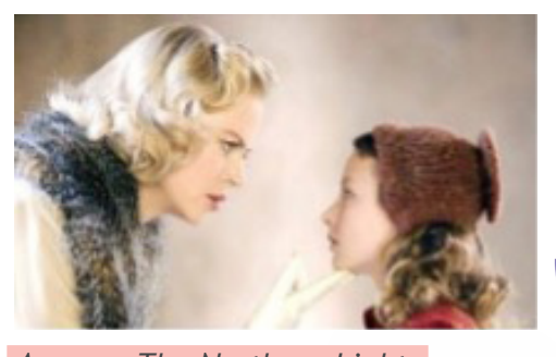
Answer: The Northern Lights

Which children's book is the film, The Golden Compass, based on?