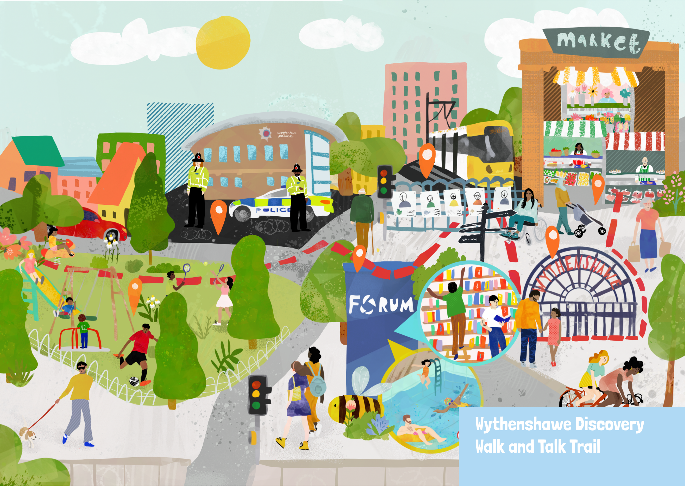
Wythenshawe Discovery Walk and Talk Trail