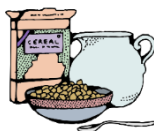
on food packaging