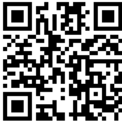
Black, Asian and Minority Ethnic Presence in UK Children's Literature in the last 3 Years:

Diversity: The inclusion of different types of people (such as people of different abilities, gender, races or cultures).