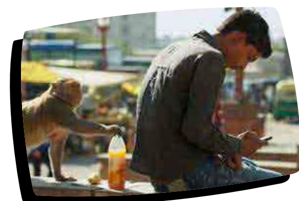
BBC's Planet Earth II