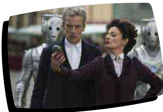
BBC's Doctor Who

Can you create some clever captions for the characters in the photos, or even come up with a catchy headline?