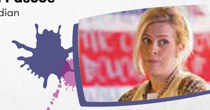
Sara Pascoe Comedian

How you say the joke is so important. Try saying it fast, and try saying it slowly. Pause before the punchline... Timing is everything! And if your audience is laughing, wait till the laughter dies down before you tell your next joke. They need to be able to hear everything.